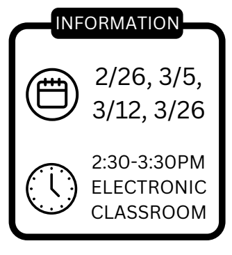
Workshop for myact.org