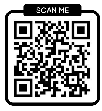
Schedule, Prep, & Practice